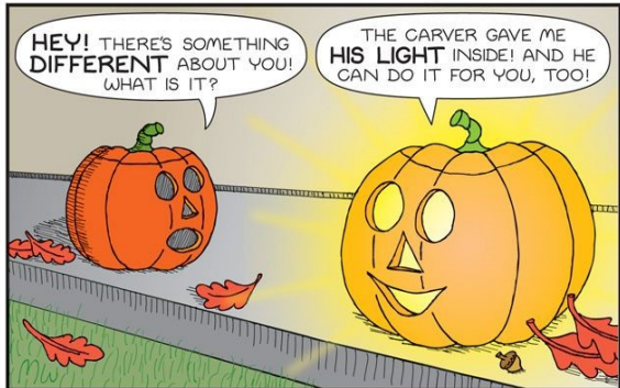
For God, who said, "Let light shine out of darkness," made his light shine in our hearts to give us the light of the knowledge of the glory of God in the face of Christ. - 2 CORINTHIANS 4:6 NV