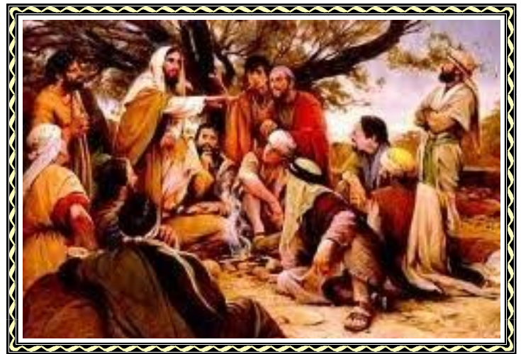
Sending of Apostles

If you wish your child to receive the Sacraments of Reconciliation and Eucharist, they must start attending Religious Education classes no later than 1st Grade. See you September 8, 2024!